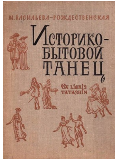
Fig. 12. The cover of the first edition

The research work formed the basis of the famous textbook.