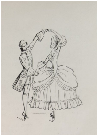
Fig. 11. The cover of the first edition